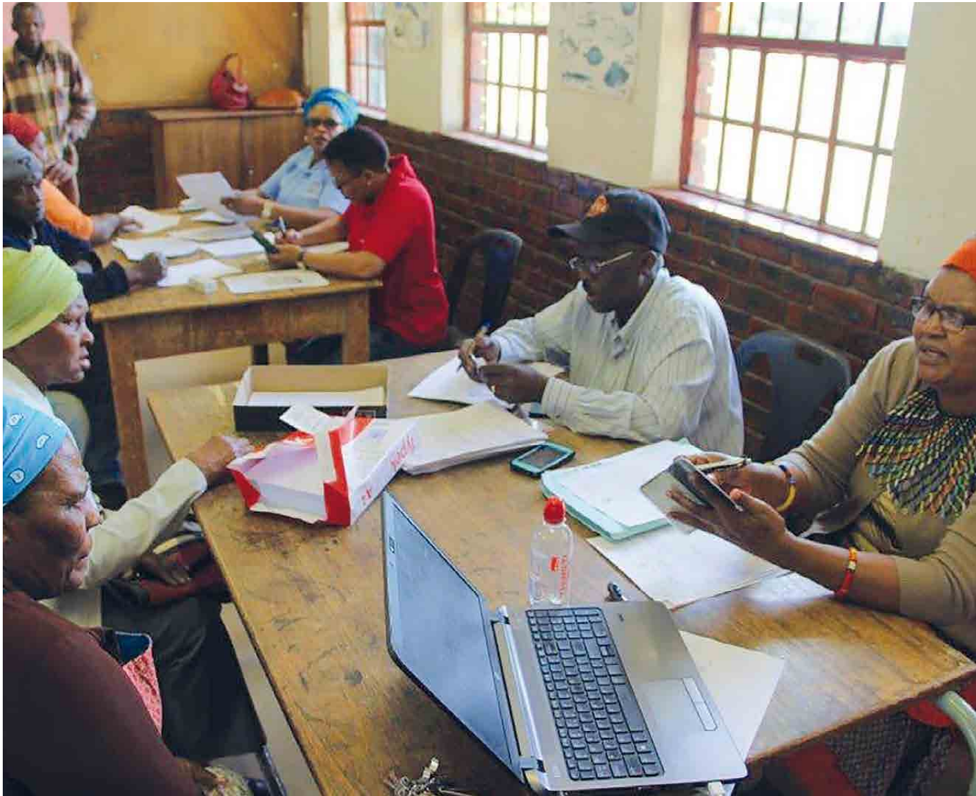
Indigent Unit officials helping the elderly to register in Mzintshane