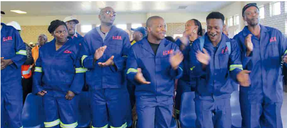
Water Leak Agents from all 50 wards