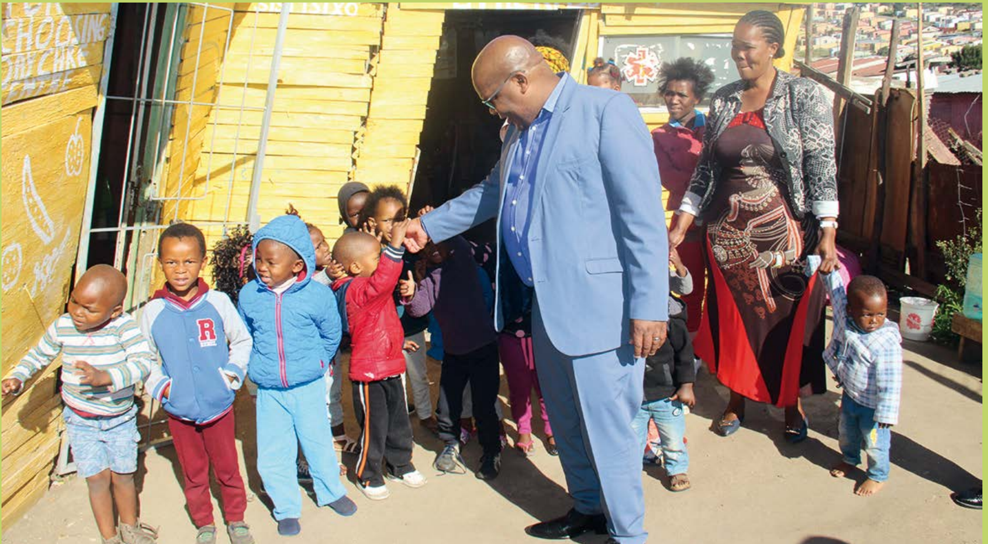
Executive Mayor Xola Pakati with the kids from Little Centre in Duncan Village