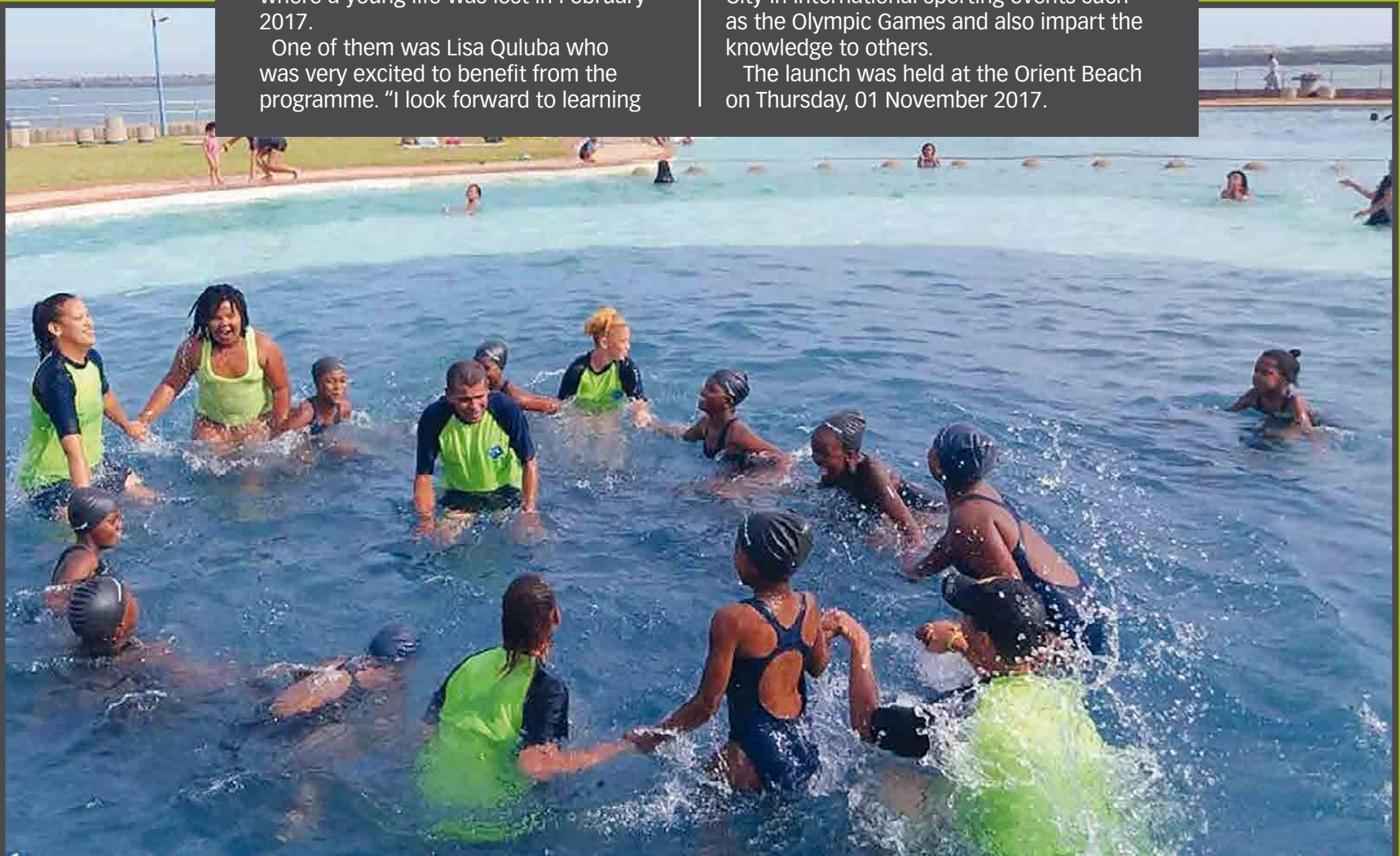
The kids get their first lesson during the event

The launch was held at the Orient Beach on Thursday, 01 November 2017.