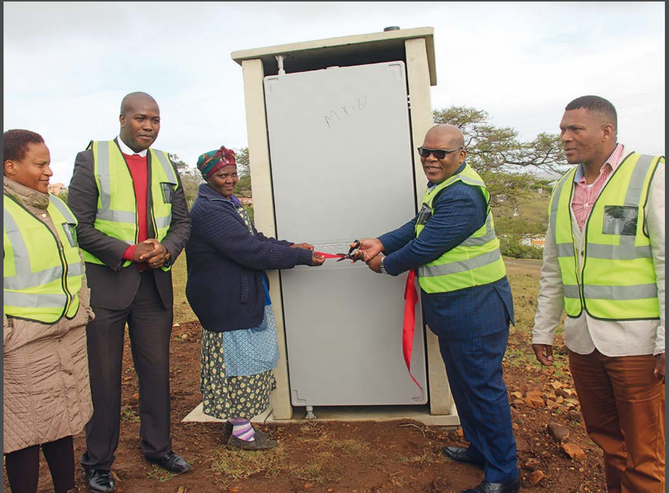
Executive Mayor Xola Pakati cuts the for the handover of VIP toilets in Ncehra Village.

The projects underway in the Ncerha Villages include the construction of bulk water