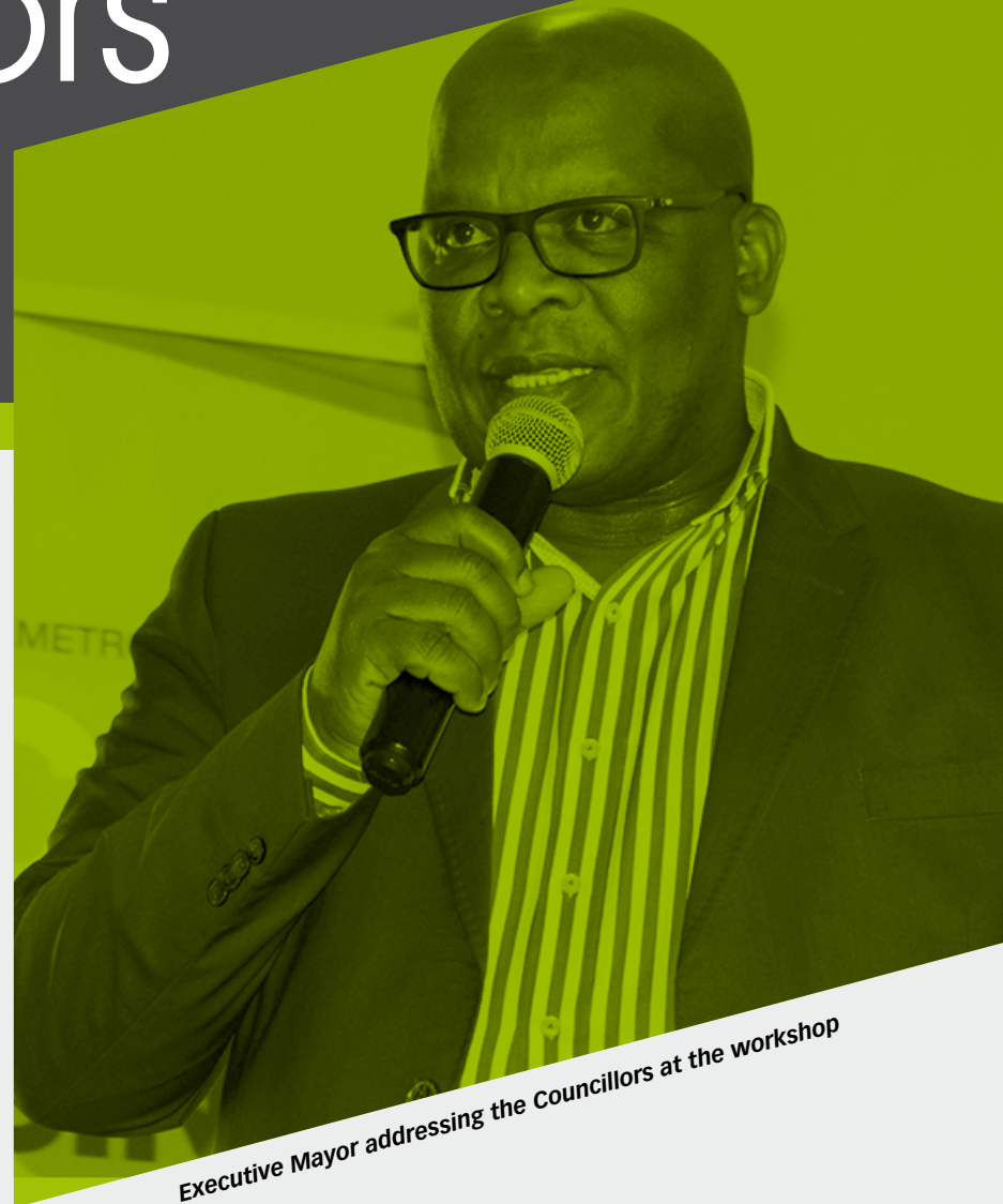
Executive Mayor addressing the Councillors at the workshop

"Number of streets lighting projects have taken place to upgrade and provide street lighting in areas requiring street lights such as Fynbos, Buffalo Flats,