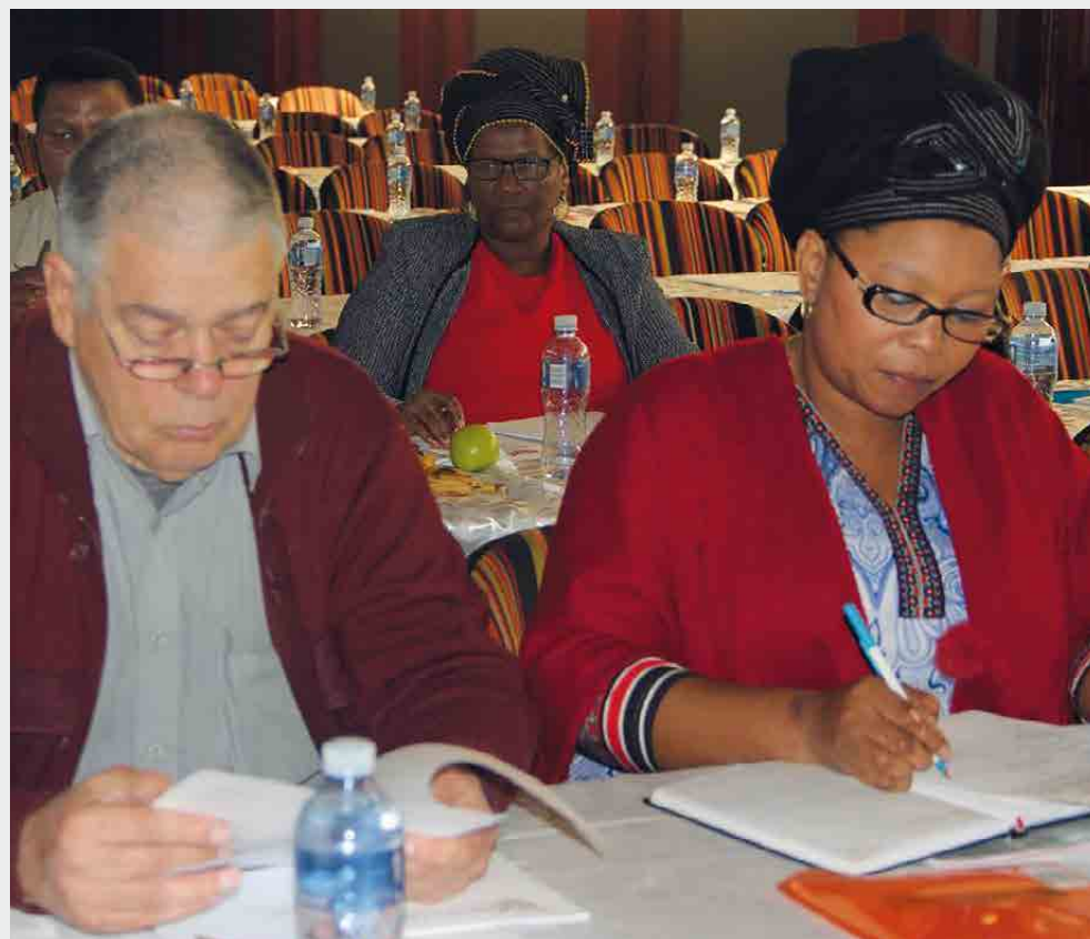
Councillors at the workshop at the EL City Hall